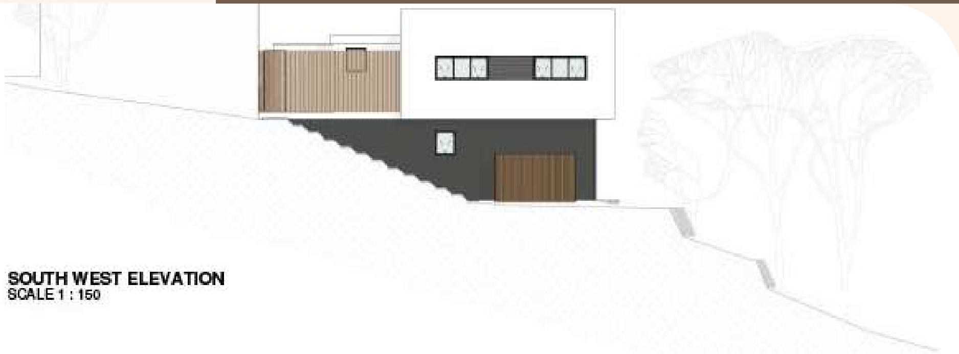
SOUTH WEST ELEVATION SCALE 1 : 150