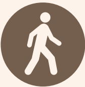
FOREST BOARDWALKS & TRAILS