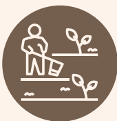
COMMUNITY HARVEST GARDEN