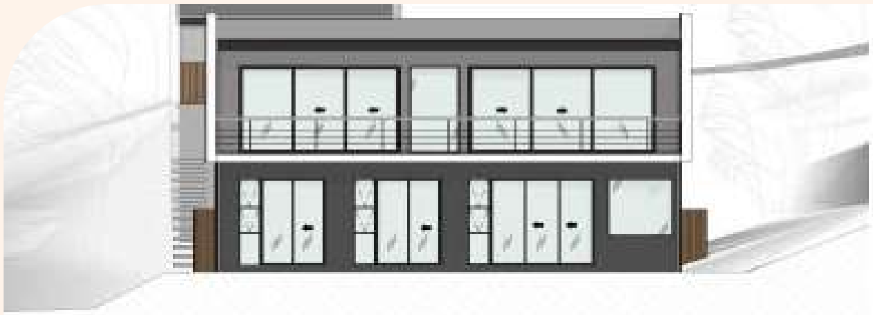
SOUTH EAST ELEVATION SCALE 1 : 150