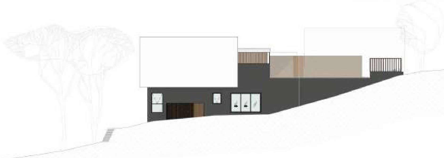
NORTH EAST ELEVATION SCALE 1 : 150