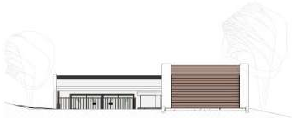
NORTH WEST ELEVATION SCALE 1 : 150